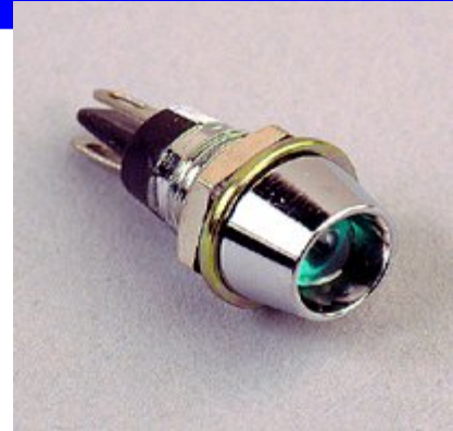
LED-440G 2 volt version shown

The Model 440 LED Indicator Light is a larger version of the Model 407. Available with either chrome body or black anodized body. It mounts in an 8 mm panel hole.