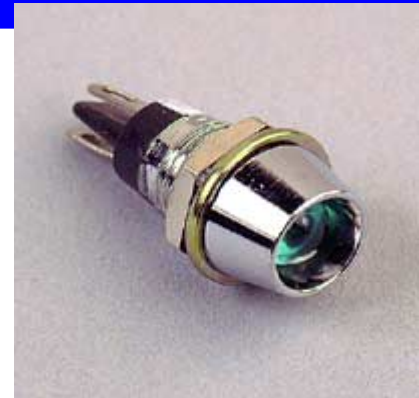
LED-440G 2 volt version shown

The Model 440 LED Indicator Light is a larger version of the Model 407. Available with either chrome body or black anodized body. Voltage range from 2-24 VDC with built in resistor. It mounts in an 8 mm panel hole. The 2 volt version is slightly shorter.